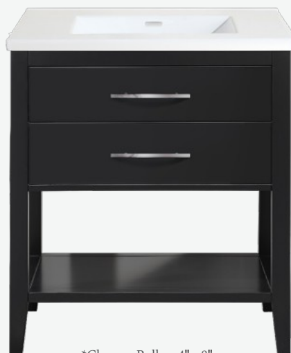
*Chrome Pulls – 4" - 8"