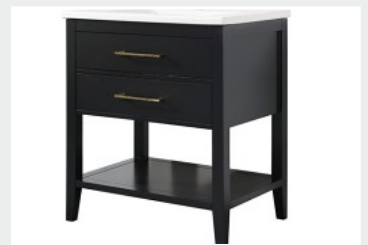
Lower open shelf for enhanced storage