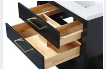
2 Soft Close Drawers with U Cuts