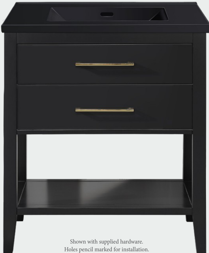
Shown with supplied hardware. Holes pencil marked for installation.

A blend of modern and colonial design with open storage and U cut drawers.