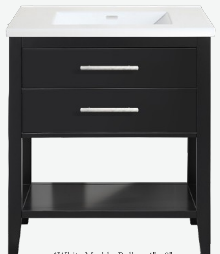
*White Marble Pulls – 4" - 8"